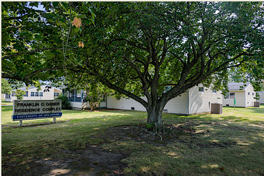
Public-private partnership to develop the Daiber Residence Complex in Lewes