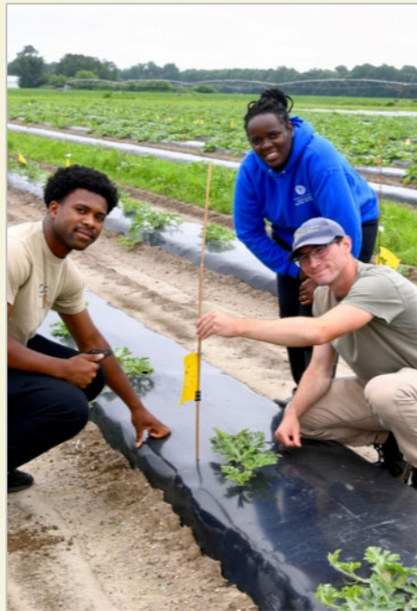
Ensuring access to education