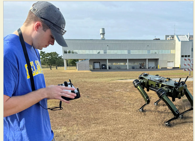
Improvements to Sharp Research Station and space for associate pathways and Osher Lifelong Learning Institute