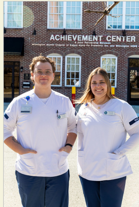
Growing the healthcare workforce