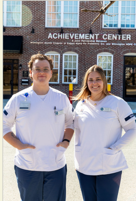
Growing the healthcare workforce