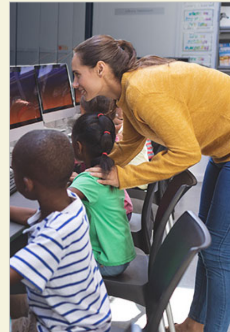
Training more teachers