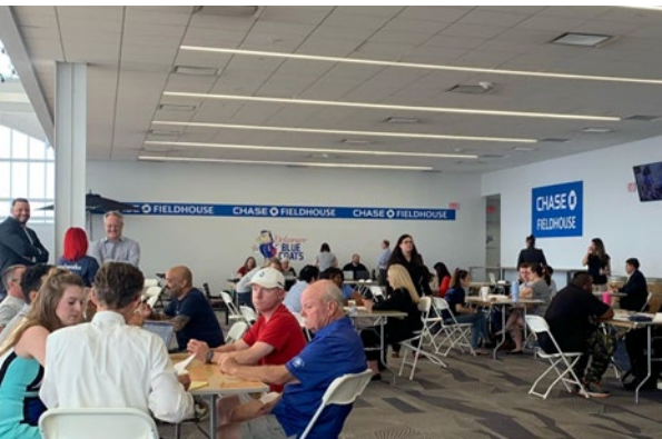
Second Chance Record Clearance & Employment Fair