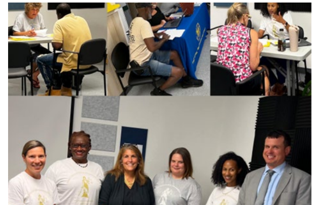
Clean Slate Delaware Expungement Clinic