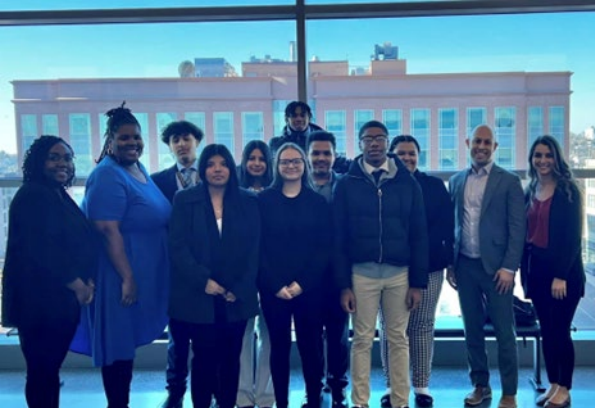
Howard High School Legal Administrative Assisting Program