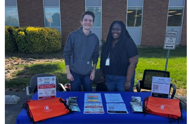
Delaware Center for Justice Community Resource Fair