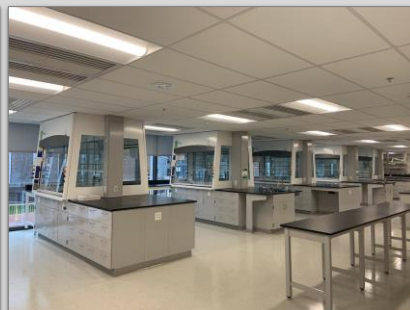
Organic chemistry teaching lab