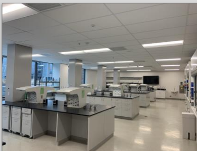
General chemistry teaching lab