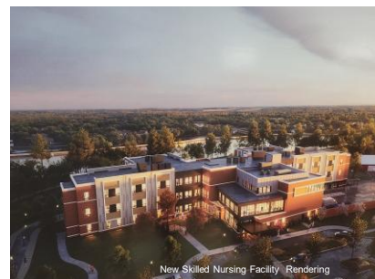
New Skilled Nursing Facility - Rendering