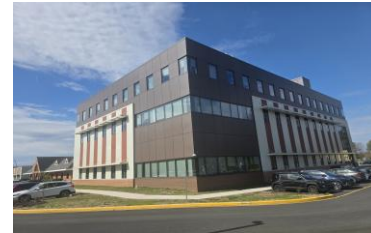
PH Lab Extension