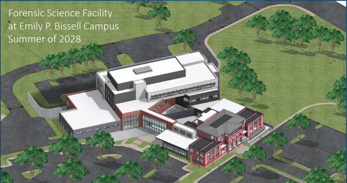
Forensic Science Facility at Emily P. Bissell Campus Summer of 2028